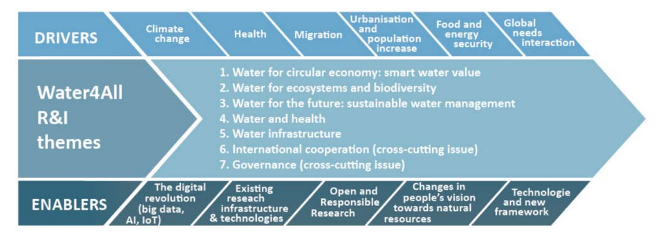
Figure 1 – Water4All RD&I's themes, drivers and enablers

The 2022 Joint Transnational Call is the first of these calls. It is implemented by 34 research and innovation funding organizations from 29 countries responsible for funding research and innovation actions in the field of water, with the financial support from the European Commission.